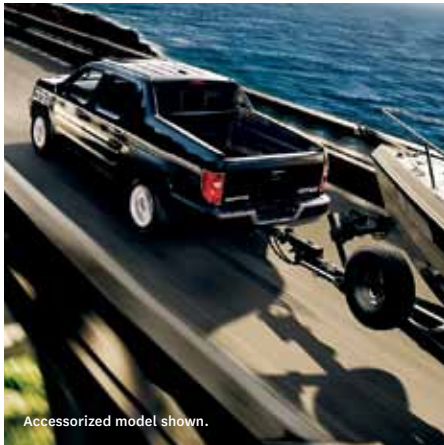
Accessorized model shown.

Under normal driving conditions, the VTM-4 system channels all power to the front differential. This maximizes efficiency when 4WD isn’t needed, like on dry pavement.