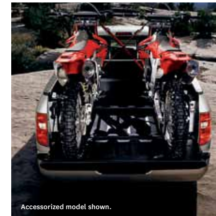
Accessorized model shown.